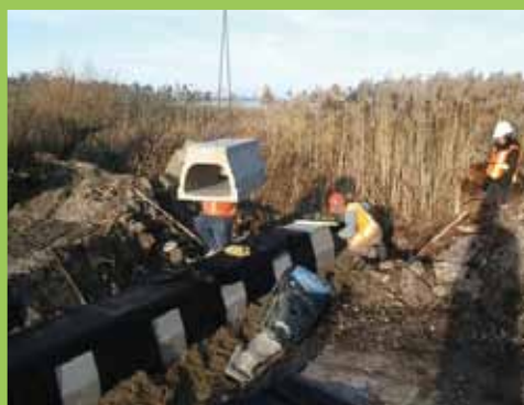
Installed three aquatic and nine terrestrial wildlife culverts under the road