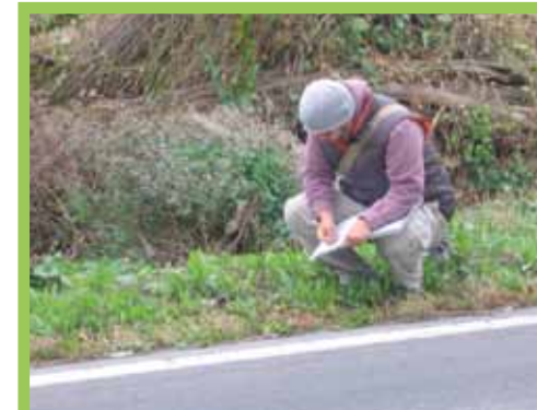
Conducted annual reptile road mortality surveys since 2008