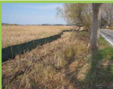
Installed more than six kilometers of exclusion fencing along the road

When completed in the fall of 2016, the Project will have achieved the following: