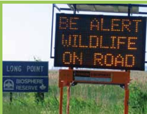
Created public awareness of the project's efforts to reduce road mortality