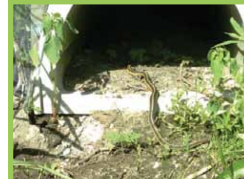
Monitored wildlife movement through the culverts using remote cameras